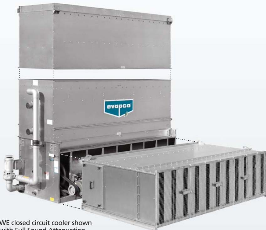
LSWE closed circuit cooler shown with Full Sound Attenuation

* When both Discharge Attenuation and Inlet Attenuation are selected, this combination is referred to as Full Attenuation.